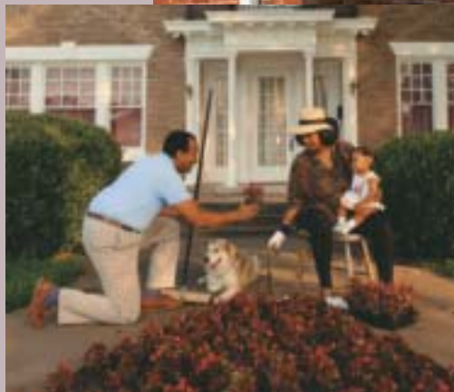
Shown in New England Slate