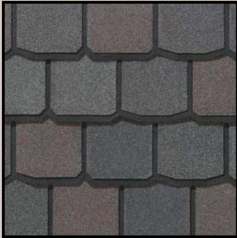
New England Slate

Roofs are big. Color is important. Choose wisely.